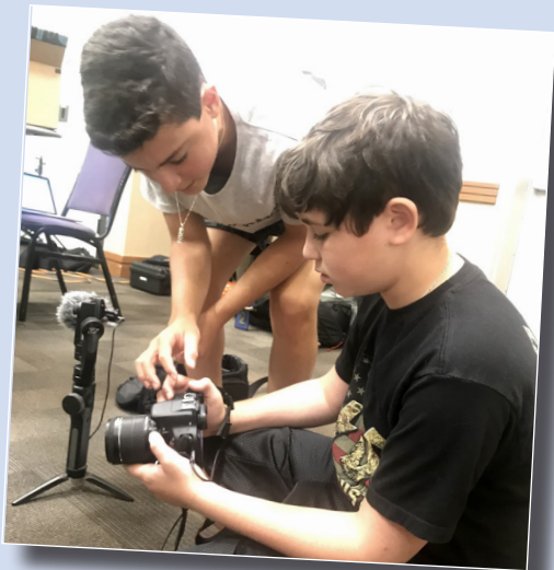
Maccabi Star Reporter

Star Reporters, coached by VOX ATL, will document the Games in real time, developing new skills and being mentored in photography, videography, and interviewing, as well as as blogging and other forms of social media. Star Reporter coaches, provided by Team Atlanta, will be experienced professionals in the fields of journalism, photography, videography, social media, and marketing.