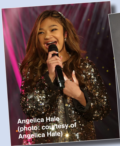
Angelica Hale