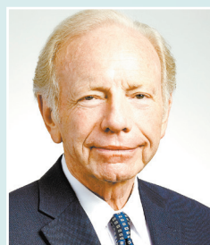
Senator Joe Lieberman