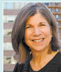
Anna Quindlen