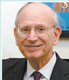
Ambassador Stuart Eizenstat