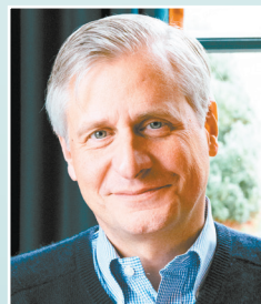
Jon Meacham