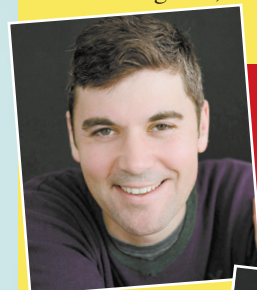
Eli Saslow

The Prologue to the Book Festival of the MJCCA will feature Pulitzer Prize-winning journalist Eli Saslow, September 20; international bestselling author Mitch Albom, October 13; Academy Award-winning actress Sally Field, October 21; Israeli investigative journalist Ronen Bergman, October 29.