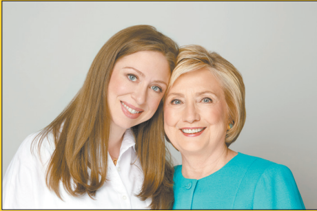
Hillary Rodham Clinton and Chelsea Clinton

To purchase tickets for each individual event, or, for a better value, purchase a series pass for access to most of the November events. Some events are free. For more information, schedule of events, and tickets, visit atlantajcc.org/bookfestival , e-mail bookfestival@atlantajcc.org , or call the MJCCA Box Office at 678-812-4002.