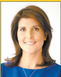
Nikki R. Haley