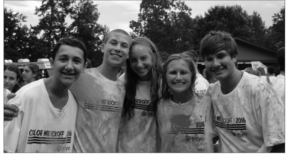
Smiling faces and kaleidoscopic colors adorn participants at MJCCA's BBYO Color Me Kickoff.

BBYO KICKOFF. The Atlanta Council BBYO hosts a kickoff event at the start of each school year, and this year it was