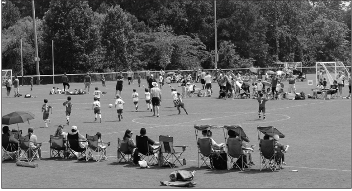
A happy crowd enjoys the new fields.