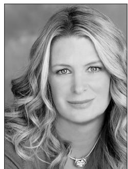
Kristin Hannah