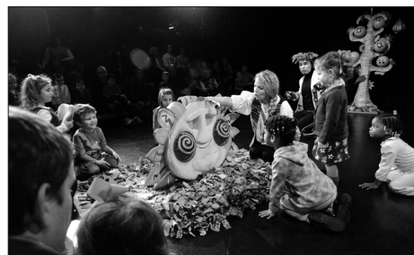
From Head to Toe

Family Theatre: From Head to Toe , presented by Alliance Theatre for the Very Young in conjunction with The High Museum of Art exhibition in the Morris & Rae Frank Theatre, October 30, 10:30 a.m., 12:00 noon, and 4:00 p.m.; $8-$14 (ideal for children ages one to five years); Dinosaur , presented by Alliance Theatre for the Very Young, and a one-of-a-kind collaboration with the Fernbank Museum of Natural History, April 2, 2017, 10:30 a.m., 12:00 noon, and 4:00 p.m., $8-$14 (ideal for children six months to five years); A Brown Bear, A Caterpillar, And A Moon: Treasured Stories by Eric Carle (presented by Mermaid Theater), April 16, 2017, 11:00 a.m. and 2:00 p.m., $10-$18 (ideal for children three to five years).