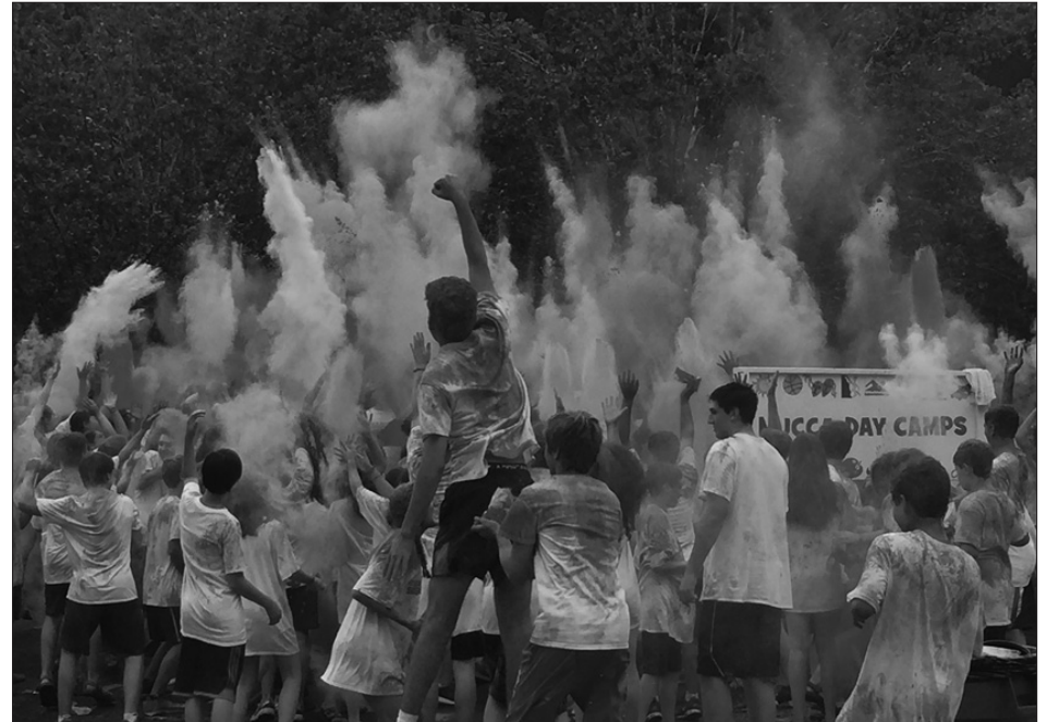
More than 260 teens celebrated the start of BBYO's 2016-2017 year at MJCCA.

אנו עומדים יחדיו We stand with Israel security • peace • solidarity