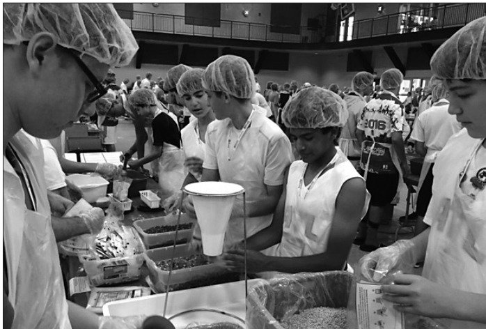
U-14 Boys Basketball players pack meals for the St. Louis Foodbank.

canoe, kayak, and bumper boat rides on RB Lake.