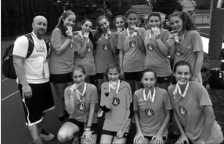
Girls Soccer team took the gold medal in Columbus.