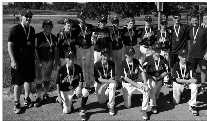
Boys Baseball team won a silver medal in St. Louis, beating the rain, a shift in the tournament schedule, and tough competition.