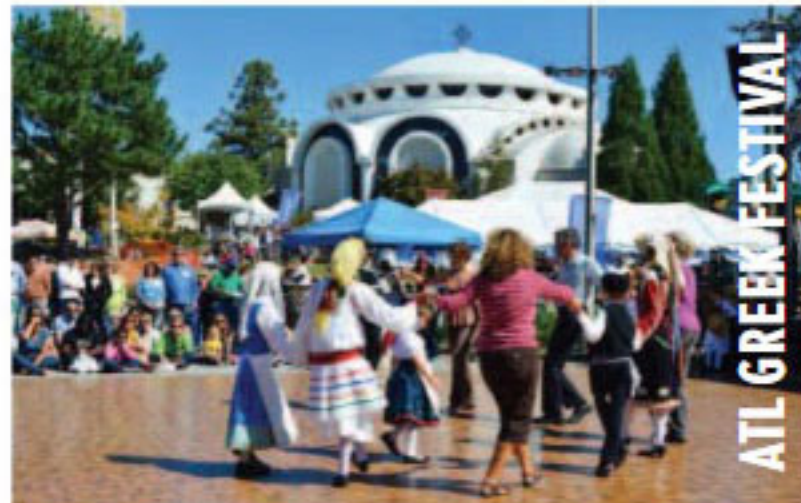
ATL GREEK FESTIVAL

Bookmark our site www.thecurrenthub.com to keep up with the latest events and activities to keep you busy. ☺